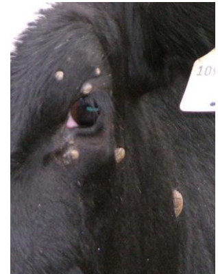
Warts around a calf's eye