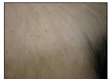
Lice on the skin of a calf