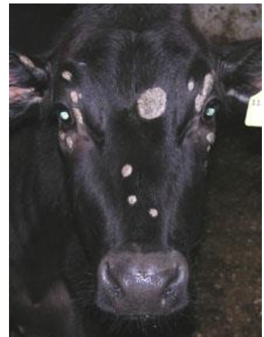
Calf with multiple ringworm lesions on head