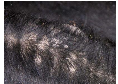
Warts on the tail head of a calf – an unusual location